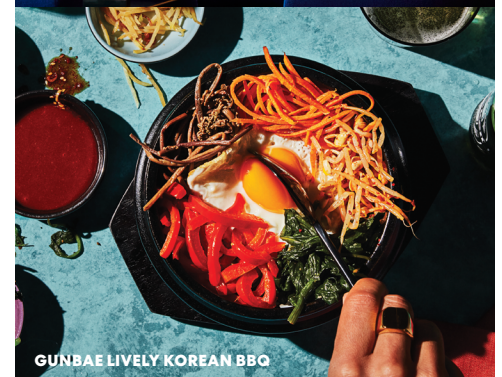
GUNBAE LIVELY KOREAN BBQ