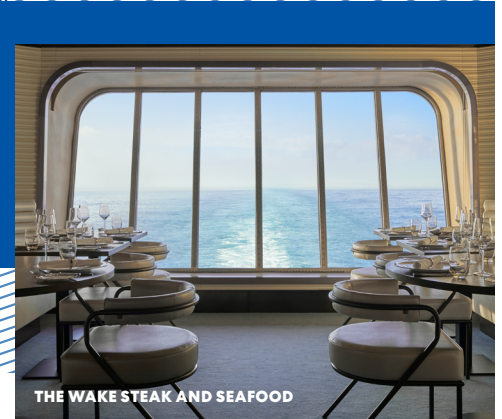
THE WAKE STEAK AND SEAFOOD