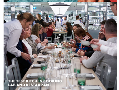
THE TEST KITCHEN COOKING LAB AND RESTAURANT