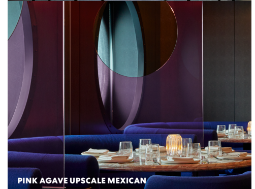
PINK AGAVE UPSCALE MEXICAN